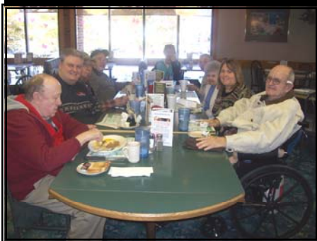
Residents enjoy a breakfast outing to Carver's in February.